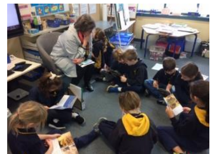
Rm 15 students participating in a Guided Reading activity.

Another important reading improvement strategy that will occur this term is the Department for Education's Year 1 Phonics Check. The development of phonics knowledge and skills is an integral part of learning to read for younger students. The screening check is not a reading test but rather a short assessment designed to assess a student's ability to decode letter sounds (phonics). The test takes 5-7 minutes to complete and will be carried out by class teachers with each individual student. Teachers will then analyse the results and if necessary, make adjustments to their teaching program to support student learning. If you have any concerns, or would like further information on how to best support your child's reading development, please speak to their class teacher.